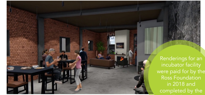
Renderings for an incubator facility were paid for by the Ross Foundation in 2018 and completed by the Mills Group.