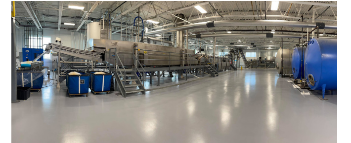
Mister Bee's recent investments include a $2.5 million fryer.

If the feasibility study should prove to be in favor of an incubator, we strongly believe it could be a catalyst for new businesses as well as a key player in revitalizing vacant downtown buildings and supporting entrepreneurship in Wood County overall.