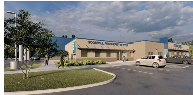
Rendering of Goodwill Industries' new state-of-the-art facility in South Parkersburg, currently set to be completed in December of 2021.