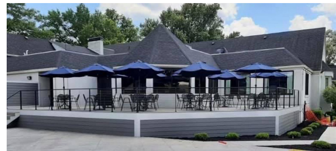
The Parkersburg Country Club pool remodel was completed in July with the help of our members Grae-Con and Pickering Associates.